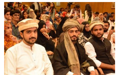
SMIU organizes Pashtun Culture Program under series of “My Beloved Pakistan”. October 25, 2018