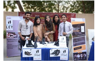
SMIU organizes Innovative Ideas Competition- December 4, 2018