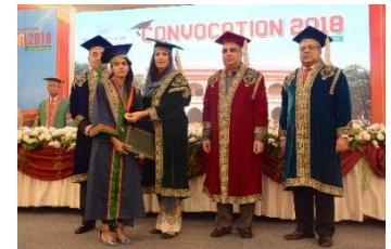
Sindh Madressatul Islam University organizes its second convocation November 17, 2018