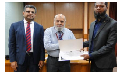
SMIU AQEC Participated in a seminar organized by Institute of Business Management (IoBM)-October 18, 2018