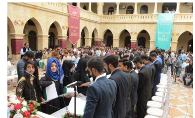
SMIU organizes Oath Taking Ceremony of newly elected office bearers of Students' Council- October 19, 2018