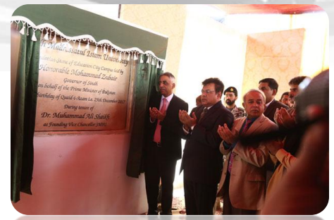
Foundation stone laid by Governor Muhammad Zubair on SMIU’s new campus in the Education City, Malir. December 25, 2017