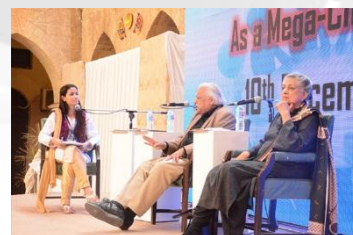
SMIU organized 4 Days Festival of Arts and Ideas 7 th -10 th December, 2017