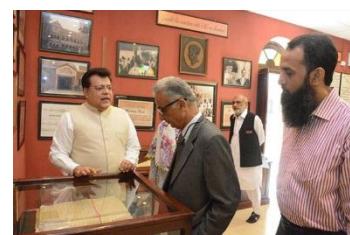
4 th Meeting of SMIU Senate held, 13 th October, 2017