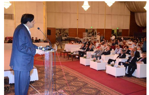
Dignitaries laud remarkable services of Sindh Madressatul Islam University at its 131st Foundation Anniversary - September 02, 2016