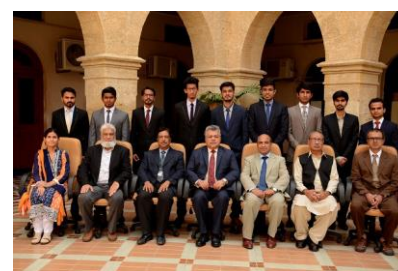
A group of SMIU students left for China for internship program September 05, 2016