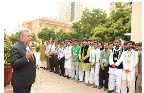
Alma-Mater of Quaid-e-Azam Mohammad Ali Jinnah Sindh Madressatul Islam University celebrates Independence Day with great national spirit – August 14, 2016