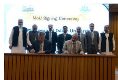
Vice Chancellors of Sindh Madressatul Islam University and Allama Iqbal Open University sign MoU – September 09, 2016